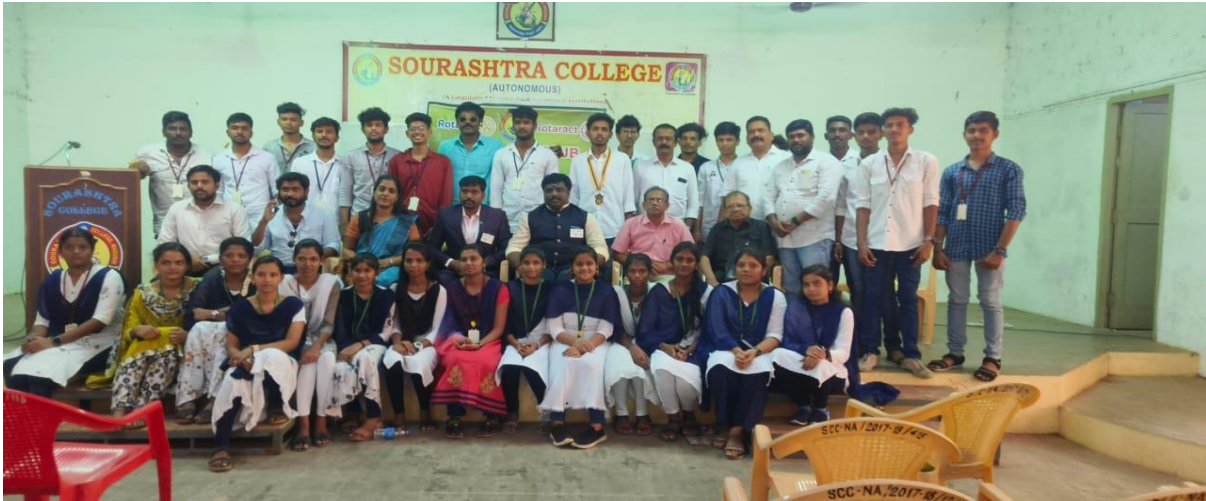
Rotaract Club inauguration